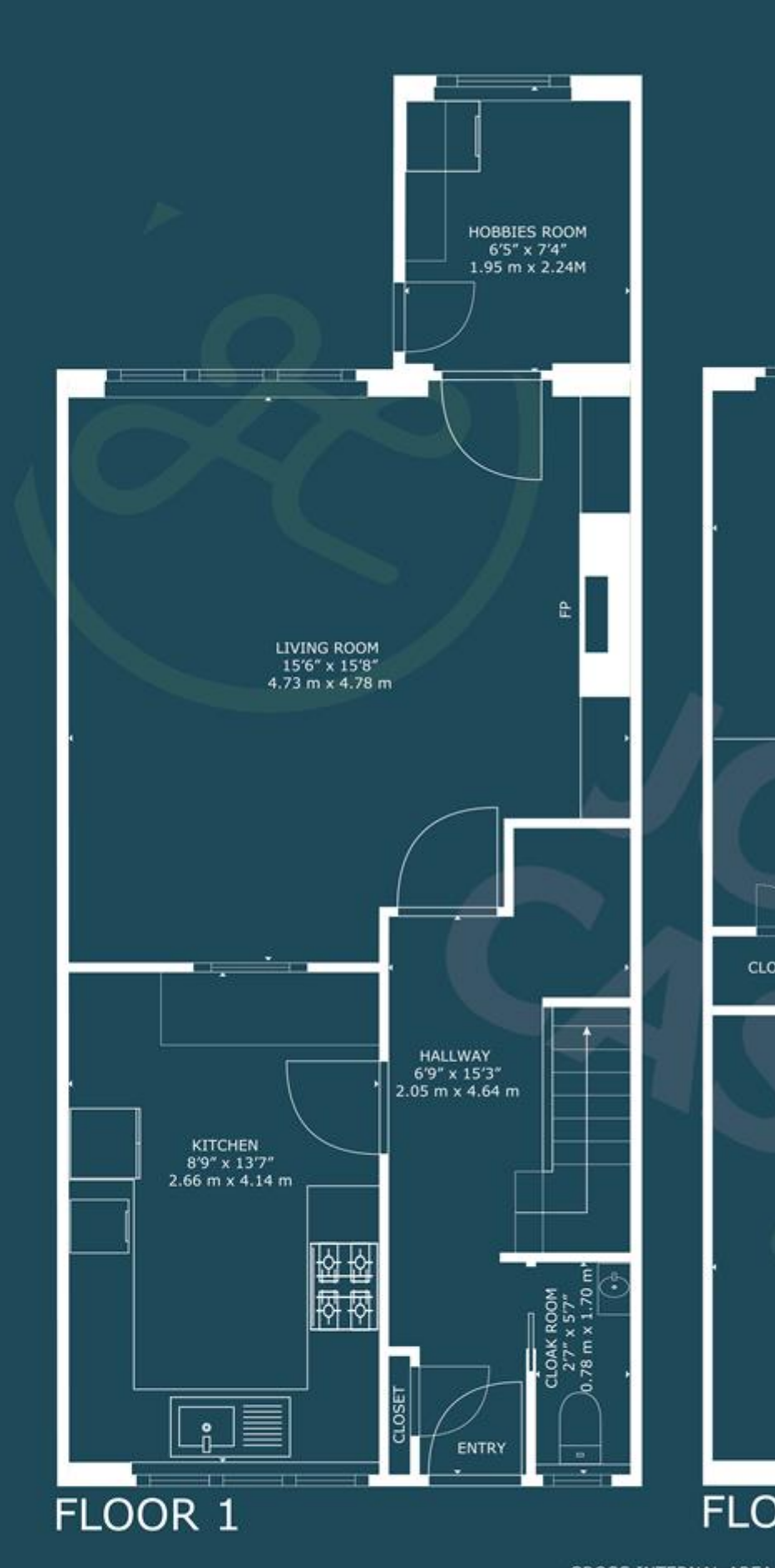
GROSS INTERNAL AREA FLOOR 1: 517 sq. ft, 48 m², FLOOR 2: 4 TOTAL: 985 sq. ft, 91 m² SIZES AND DIMENSIONS ARE APPROXIMATE