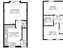
FLOOR 1 FLOOR 2

© 2023 BY MATTERTOP MATTERTOP IS A REGISTERED TRADEMARK OF MATTERTOP LTD. ALL RIGHTS RESERVED. MATTERTOP.COM